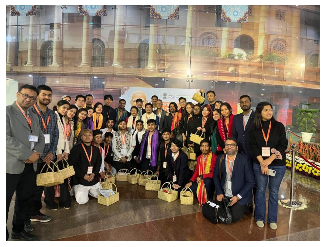
Our students participating in the Northeast Sammelan held in February 2024.

Our students bagged the 1<sup>st</sup> Position in the Tug-of-War competition at the NESSDU Sports Meet, 2024.